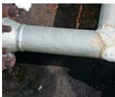
Corrosion Under Insulation