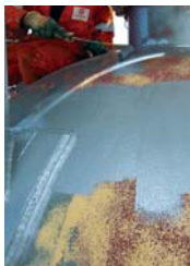
Rust Grip® penetrates deep into the pores of and seals the surface from further corrosion.

Corrosion prevention and protection for the past 50 years has yielded inefficiencies for industries that depend on critical infrastructure. With many of these methods, limited success is achieved because most corrosion coatings are "glue-on-to-surface." This process doesn't allow for corrosion to be controlled in the pores of applied surfaces and won't protect against mold and mildew among other environmental toxins