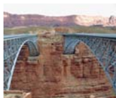
Hoover Dam Bridge