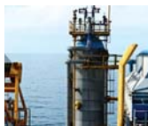
Offshore Drilling Rig