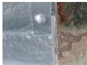
Rust Grip® requires minimal preparation and no white sand blasting of the surface.

After one application, it can penetrate deep into and seal the surface, blocking corrosion quickly and effectively.