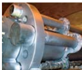
Drill Pipe Risers